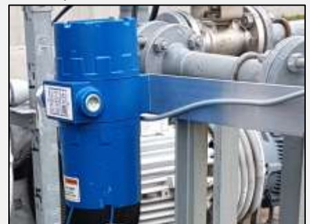
HazLoc area monitoring