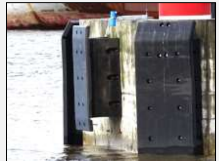
Fixed port installation