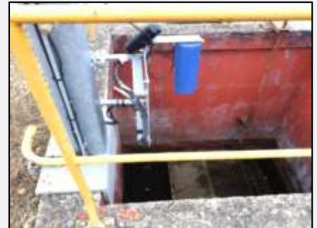
Sump water monitoring