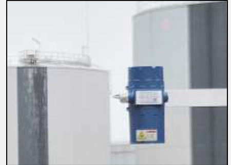
Industrial spill & leak detection